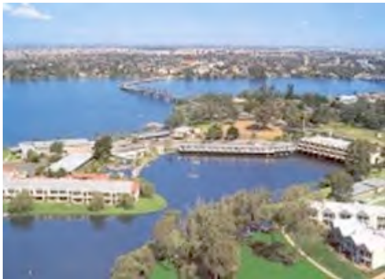
Aerial view of Mulwala / Yarrawonga

Bookings need to be done well in advance o secure your desired accommodation